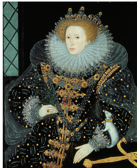
THE ERMINE PORTRAIT (ELIZABETH I AS REGINA ). WILLIAM SEGAR, 1585

Years earlier he had recounted the same conversation in a letter to Bullinger. There he wrote: