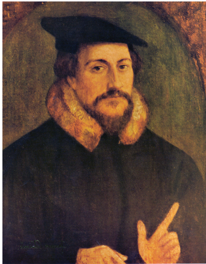
JOHN CALVIN. ATTRIBUTED TO HANS HOLBEIN THE YOUNGER, 1550S

These letters were not, as was the case with some others, warm and intimate, but rather were occasioned first by Elizabeth's succession to the throne after Mary, Queen of Scots, and then later by Elizabeth's response to John Knox's notorious First Blast of the Trumpet . When Elizabeth ascended and began re-establishing the Protestant church, Calvin wrote to encourage her to continue the reformation. He wrote to Cecil that he should encourage her "to scatter the superstitions of popery which have overshadowed your land for the last four years, and to cause the uncorrupted doctrine of the gospel and the pure worship of God again to flourish among you" and "having once entered upon the right path, she should unflinchingly persevere therein." 6