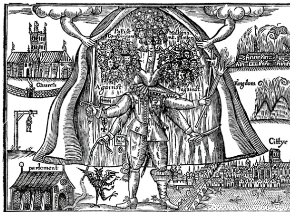
THE DISSENER'S DREAD: A WOODCUT SHOWING THE BODY POLITIC AS HALF-PAPIST AND HALF-CAVALIER. ANONYMOUS.