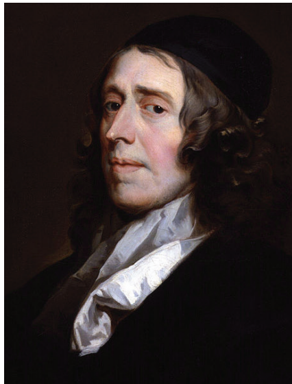
JOHN OWEN. JOHN GREENHILL, D. 1676

2. There is a promise in the Scripture...made and belonging unto the church unto the end of the world, of the communication of the Holy Spirit unto it...in prayer.